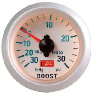
2701SW-PSI MECHANICAL BOOST GAUGE