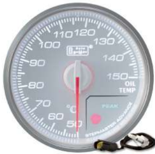
AGOTWHCL-60PK-R ELECTRICAL OIL TEMP GAUGE ! >118°C