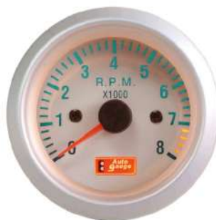
60543SW ELECTRICAL TACHOMETER