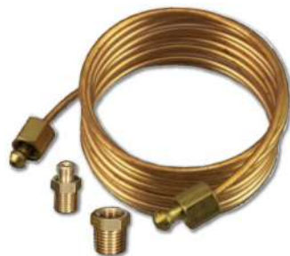
NO.96-7 MECHANICAL OIL PRESSURE GAUGE TUBING KIT( BARSS ) 72" 7PCS NUT