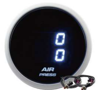
AGEDAPLCD-BL ELECTRICAL AIR PRESS GAUGE 0~13.8BAR / 0~200PSI