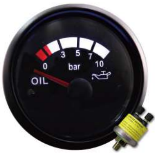
AGAOP ELECTRICAL OIL PRESSURE GAUGE