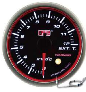
60AGEGT-RSM ELECTRICAL EXHAUST GAS TEMP GAUGE ! >850°C