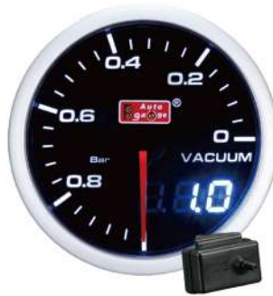
AGVABLED-60WA ELECTRICAL VACUUM GAUGE