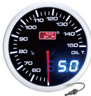
AGOTBLED-60WA ELECTRICAL OIL TEMP GAUGE