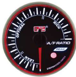
52AGAFR-RMT-R ELECTRICAL AIR FUEL RATIO GAUGE ! >LEAN (NARROW BAND)