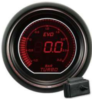
AGEVOBO ELECTRICAL BOOST GAUGE