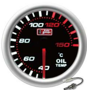
27047SWL-SM ELECTRICAL OIL TEMP GAUGE STEPPER MOTOR MOVEMENT