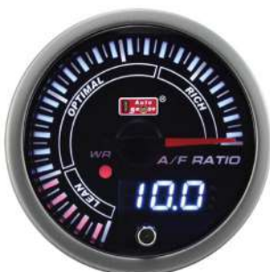
52F25L-AFR-R ELECTRICAL AIR FUEL RATIO GAUGE ! >LEAN ( NARROW BAND )