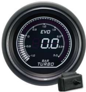
AGEVOWGBO ELECTRICAL BOOST GAUGE