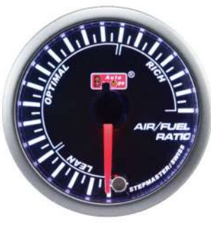
AGAFRSMSWL270-WB ELECTRICAL AIR FUEL RATIO GAUGE ⚠️ >LEAN ( NARROW BAND )