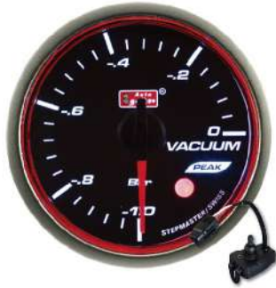
52AGVA-RMT-R ELECTRICAL VACUUM GAUGE ! ≥0BAR