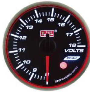
60AGVO-RMT-R ELECTRICAL VOLT GAUGE ! <11.5V