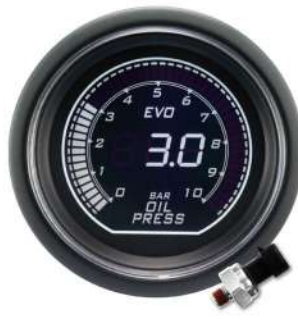
AGEVOWGEOP ELECTRICAL OIL PRESSURE GAUGE