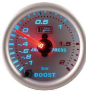
27001SW3-7-BAR MECHANICAL BOOST GAUGE