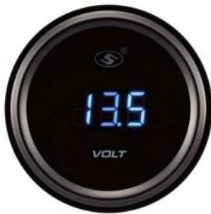
1224VO-DG-12 ELECTRICAL VOLT GAUGE 8~16V