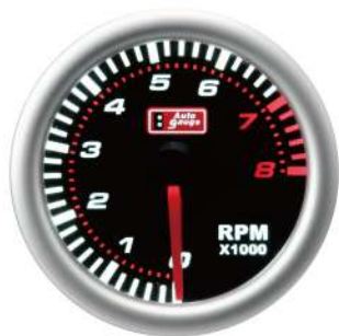
270543SWL-SM ELECTRICAL TACHOMETER STEPPER MOTOR MOVEMENT