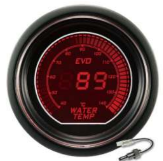
AGEVOWT ELECTRICAL WATER TEMP GAUGE