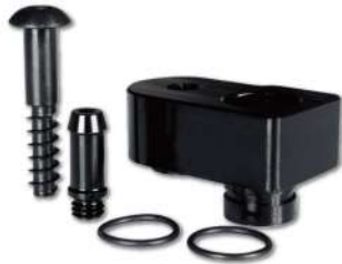
AGADPTBO-1 FOR BENZ M270 ENGINE