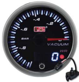
60F25L-VA-R ELECTRICAL VACUUM GAUGE ≥0BAR