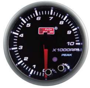
10CTASMSWL-PK ELECTRICAL TACHOMETER ! <4,000RPM , >6,000RPM