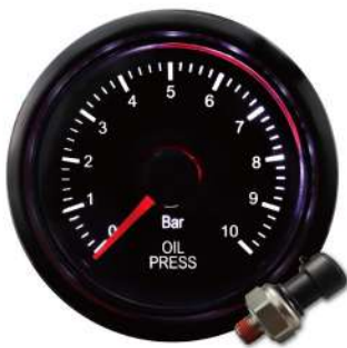
AGAOP270-E ELECTRICAL OIL PRESSURE GAUGE