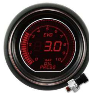
AGEVOEOP ELECTRICAL OIL PRESSURE GAUGE