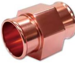
WT3-40 40 mm