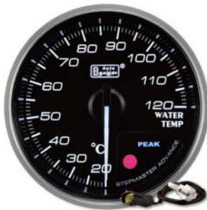
AGWTCL-PK-R ELECTRICAL WATER TEMP GAUGE ! >100°C