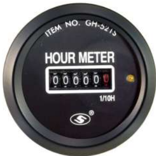
NO.GH521S ELECTRICAL HOUR METER GAUGE 6~50V