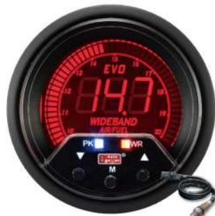
AGEVOAFR-60PKWB4.9-WO ELECTRICAL WIDEBAND AIR FUEL RATIO GAUGE ! >18AFR