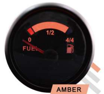
AMBER DISPLAY | DOUBLE VISION |