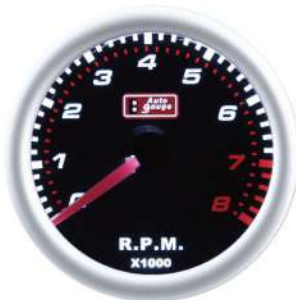
60543SWL-SM ELECTRICAL TACHOMETER STEPPER MOTOR MOVEMENT