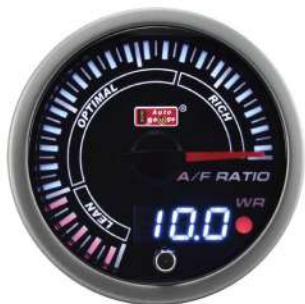
60F25L-AFR-R ELECTRICAL AIR FUEL RATIO GAUGE >LEAN (NARROW BAND)