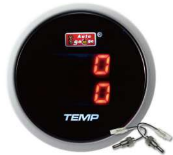
AGDTLCD-R ELECTRICAL DUAL TEMP GAUGE