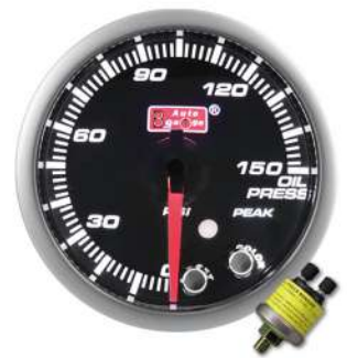
10COPSMSWL-60PK ELECTRICAL OIL PRESSURE GAUGE ⚠ <10PSI , >150PSI