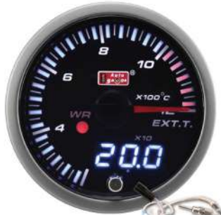
52F25L-EGT-R ELECTRICAL EXHAUST GAS TEMP GAUGE ! >850°C