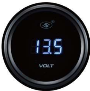
AGTVO-12DG ELECTRICAL VOLT GAUGE