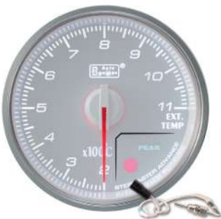
AGEGTHWHCL-60PK-R ELECTRICAL EXHAUST GAS TEMP GAUGE ! >850°C