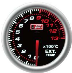
27057SWL-SM ELECTRICAL EXHAUST GAS TEMP GAUGE STEPPER MOTOR MOVEMENT