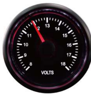
AGAVO270 ELECTRICAL VOLT GAUGE