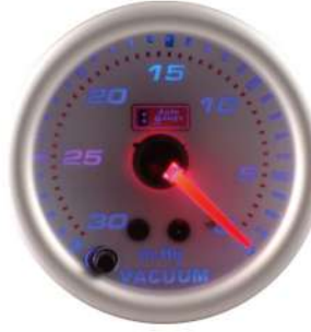
27071SW3-7 MECHANICAL VACUUM GAUGE