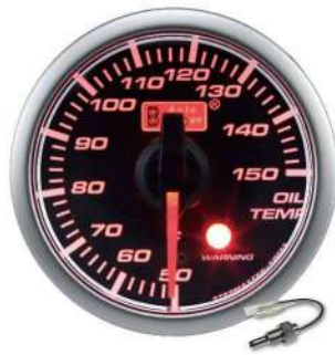
45AOTCL270-SM ELECTRICAL OIL TEMP GAUGE ! >118°C