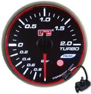
52AGBO-RMT-R ELECTRICAL BOOST GAUGE ! >1.5BAR