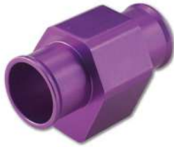
WT3-28 28 mm