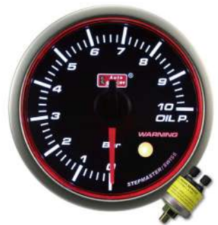
52AGOP-RSM ELECTRICAL OIL PRESSURE GAUGE ! <0.75BAR