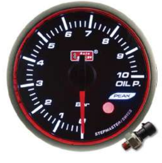
52AGOP-RMT-R ELECTRICAL OIL PRESSURE GAUGE ! <0.75BAR