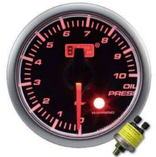
45AOPCL270-SM ELECTRICAL OIL PRESSURE GAUGE ! <0.75BAR