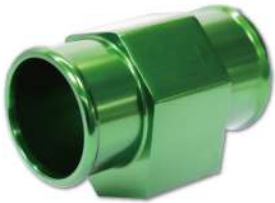
WT3-36 36 mm