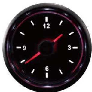
AGACK270 ELECTRICAL CLOCK GAUGE