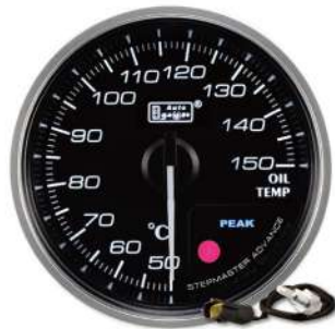
AGOTCL-PK-R ELECTRICAL OIL TEMP GAUGE ! >118°C