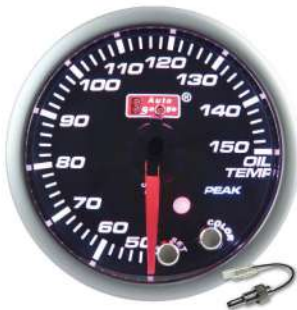
10COTSMSWL-PK ELECTRICAL OIL TEMP GAUGE ! <50°C , >120°C