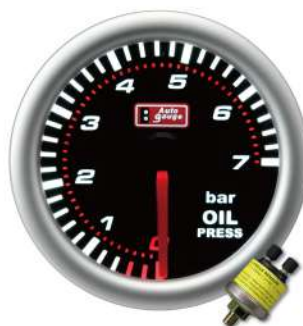
27027SWL-SM ELECTRICAL OIL PRESSURE GAUGE STEPPER MOTOR MOVEMENT