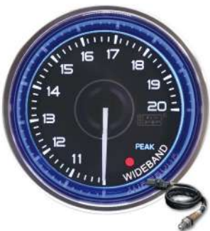
AGAFRCL-BLPKWB4.9-WO-R ELECTRICAL WIDEBAND AIR FUEL RATIO GAUGE ! >18AFR