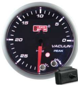
10CVASMSWL-PK ELECTRICAL VACUUM GAUGE ! <30inHg , ≥0inHg