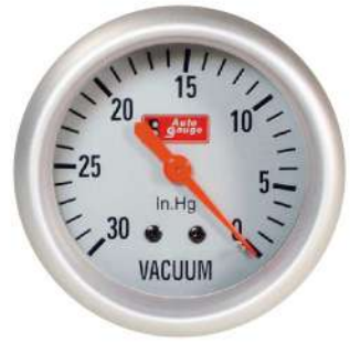
4471SS MECHANICAL VACUUM GAUGE