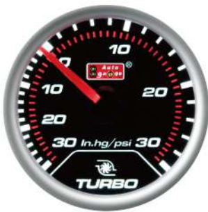
AU-BOSWL270 MECHANICAL BOOST GAUGE