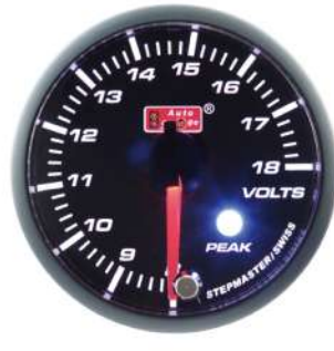
AGVOSMBLSWL270-60PK ELECTRICAL VOLT GAUGE ! <11.5V