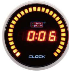
AGCKLCD-RED ELECTRICAL CLOCK GAUGE CENTRAL RED LED