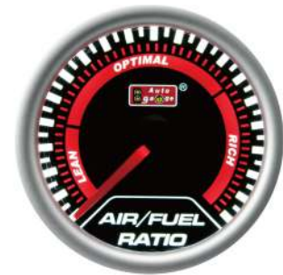
AU-AFSWL270-SM ELECTRICAL AIR FUEL RATIO GAUGE ( NARROW BAND ) STEPPER MOTOR MOVEMENT