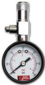
TG-040B 1 1/2" TIRE GAUGE (BLACK COLOR)