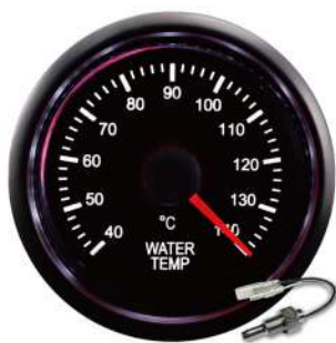
AGAWT270 ELECTRICAL WATER TEMP GAUGE