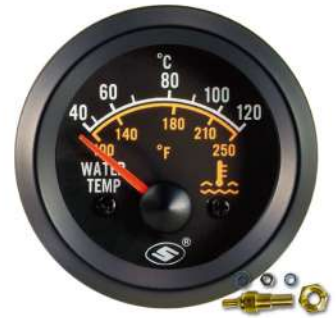
NO.1224WT ELECTRICAL WATER TEMP GAUGE 1/8 NPT SENSOR M16*1.5 ADAPTER