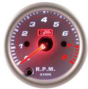
270543SW3-7 ELECTRICAL TACHOMETER