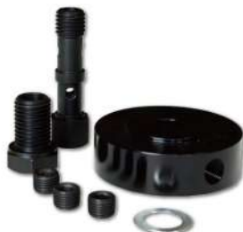
AGADPTOP-4 FOR VW R SERIES