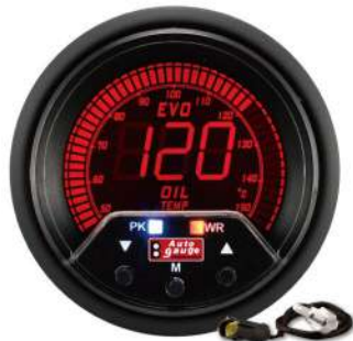
AGEVOOT-60PK-R ELECTRICAL OIL TEMP GAUGE ! >118°C