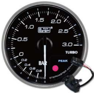
AGBOCL-PK-R ELECTRICAL BOOST GAUGE ! >2.5BAR