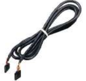
GAUGE TO CONTROL UNIT WIRE HARNESS (200cm)