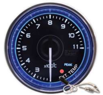
AGEGTCL-60BLPK-R ELECTRICAL EXHAUST GAS TEMP GAUGE ! >850°C