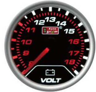
AU-VOSWL270-SM ELECTRICAL VOLT GAUGE STEPPER MOTOR MOVEMENT