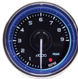
AGTACL-60BLPK-R ELECTRICAL TACHOMETER ! >6,500RPM