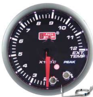
10CEGTSMSWL-PK ELECTRICAL EXHAUST GAS TEMP GAUGE ! <200°C , >850°C