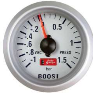
2701SS-BAR MECHANICAL BOOST GAUGE