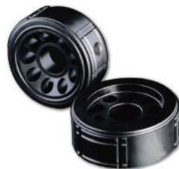
AGADPTOP-2 UNIVERSAL TYPE