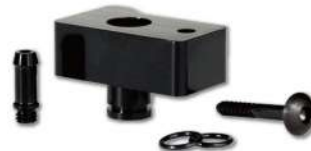
AGADPTBO-2 FOR VW GOLF MK7