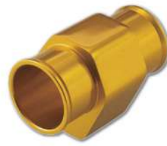
WT3-32 32 mm