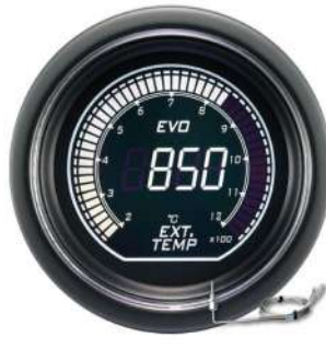
AGEVOWGEGT ELECTRICAL EXHAUST GAS TEMP GAUGE