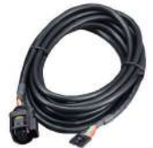
SENSOR TO CONTROL UNIT WIRE HARNESS (300cm)