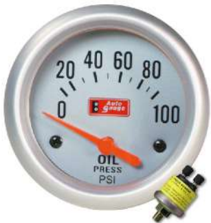
4427SS ELECTRICAL OIL PRESSURE GAUGE