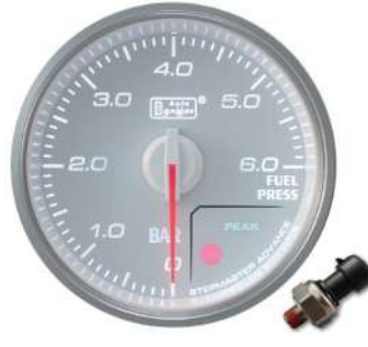
AGFPWHCL-60PK-R ELECTRICAL FUEL PRESSURE GAUGE ! <2BAR