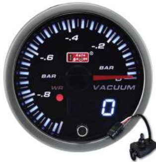
52F25L-VA-R ELECTRICAL VACUUM GAUGE ! ≥0BAR