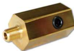
AGADPTOP-5 FOR GT86