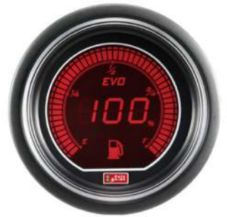
AGEVOFL ELECTRICAL FUEL LEVEL GAUGE