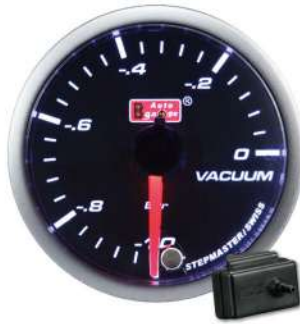
AGVASMSWL270-WB ELECTRICAL VACUUM GAUGE ⚠️ ≥0BAR