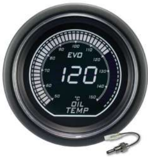
AGEVOWGOT ELECTRICAL OIL TEMP GAUGE