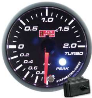
AGBOSMBLSWL270-60PK ELECTRICAL BOOST GAUGE ! >1.5BAR