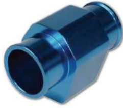
WT3-30 30 mm