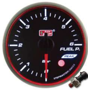
52AGFP-RPK ELECTRICAL FUEL PRESSURE GAUGE ! <2BAR