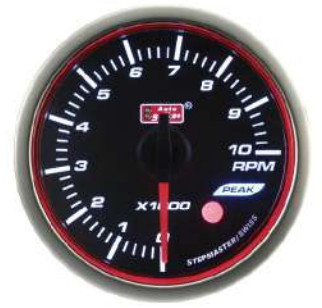
52AGTA-RMT-R ELECTRICAL TACHOMETER ! >6,500RPM