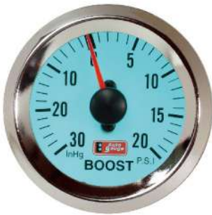
2701SEL-2-PSI MECHANICAL BOOST GAUGE