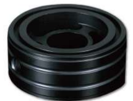
AGADPTOP-3 FOR HONDA R18/R20A