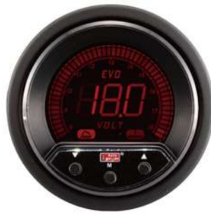
AGEVOVO-PK-R ELECTRICAL VOLT GAUGE ! <11.5V