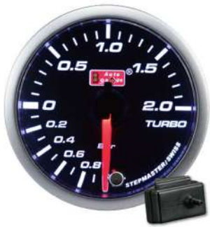
AGBOSMSWL270-WB ELECTRICAL BOOST GAUGE ⚠️ >1.5BAR