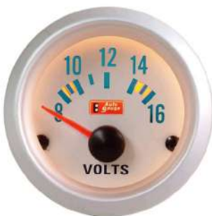
2791SW ELECTRICAL VOLT GAUGE