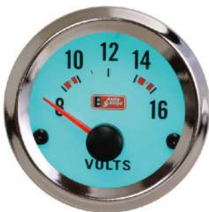
2791SEL-2 ELECTRICAL VOLT GAUGE