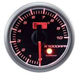
45ATACL270-SM ELECTRICAL TACHOMETER ! >6,500RPM