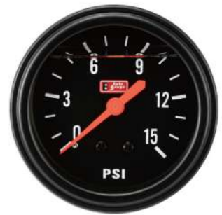
65AGLFFP MECHANICAL FUEL PRESSURE GAUGE