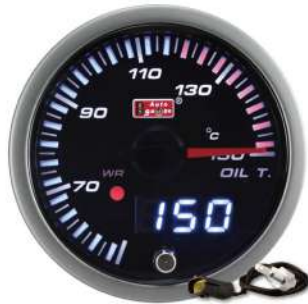
52F25L-OT-R ELECTRICAL OIL TEMP GAUGE ! >118°C