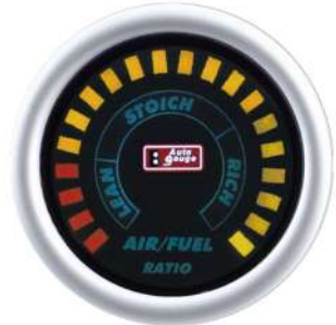
AFRLEDSWEL-20B ELECTRICAL AIR FUEL RATIO GAUGE ( NARROW BAND )