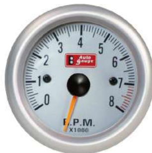
60543SS ELECTRICAL TACHOMETER