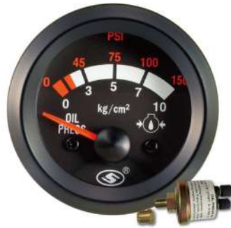
NO.1224OP ELECTRICAL OIL PRESSURE GAUGE 1/8 NPT SENSOR 1/4 NPT ADAPTER