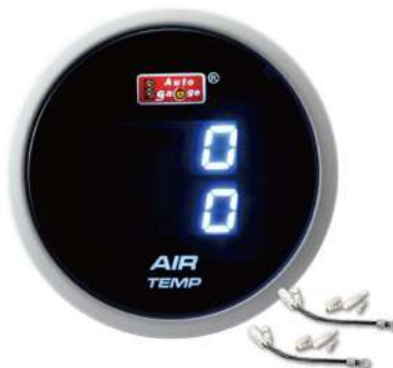
AGDATLCD-BL ELECTRICAL DUAL AIR TEMP GAUGE