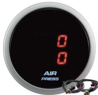
AGEDAPLCD-R ELECTRICAL AIR PRESS GAUGE 0~13.8BAR / 0~200PSI