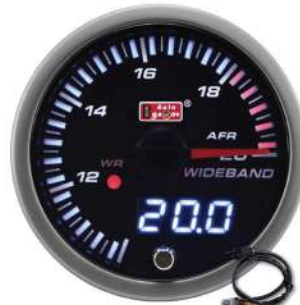
52F25L-AFRPKWB4.9-WO ELECTRICAL WIDEBAND AIR FUEL RATIO GAUGE ! >18AFR