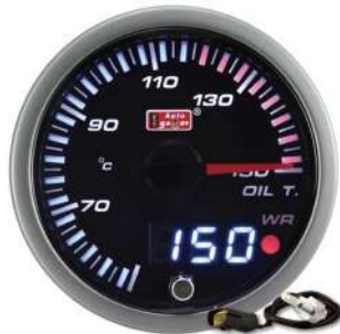
60F25L-OT-R ELECTRICAL OIL TEMP GAUGE >118°C