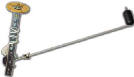
FUEL TANK FLOAT