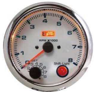
2302SSC-8000 ELECTRICAL TACHOMETER 95MM