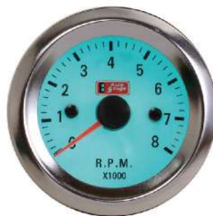
60543SEL-2 ELECTRICAL TACHOMETER