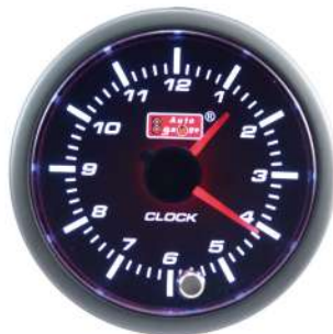
AGCKSMSWL270-60 ELECTRICAL CLOCK GAUGE 60MM