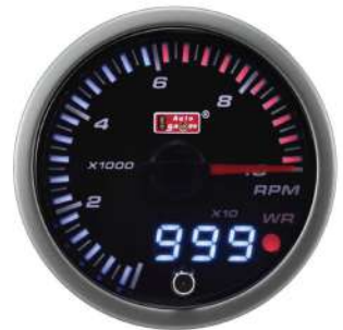
60F25L-TA-R ELECTRICAL TACHOMETER >6,500RPM