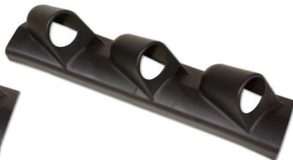
AL-03B (BLACK) AL-03CA (CARBON LOOK)