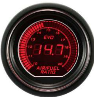
AGEVOAFR ELECTRICAL AIR FUEL RATIO GAUGE