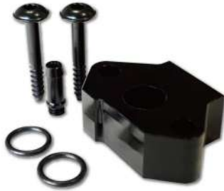
AGADPTBO-4 FOR VW 1.2/1.4 TSI/TFSI