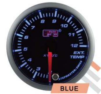
BLUE DISPLAY | DOUBLE VISION | | MOUNTING CAP & GAUGE CAP |