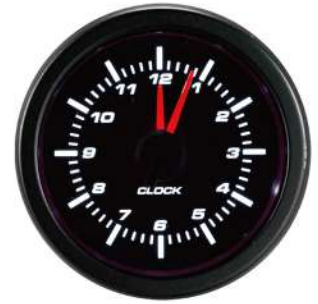
AGTCK-12 ELECTRICAL CLOCK GAUGE WHITE LED BACKLIGHT