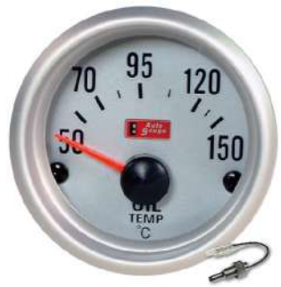
2747SS ELECTRICAL OIL TEMP GAUGE