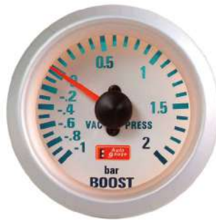
2701SW-BAR MECHANICAL BOOST GAUGE