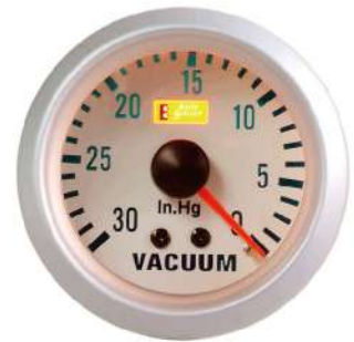
2771SW MECHANICAL VACUUM GAUGE