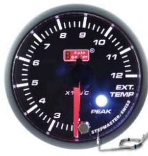
AGEGTSMBLSWL270-60PK ELECTRICAL EXHAUST GAS TEMP GAUGE ! >850°C