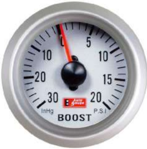
2701SS-PSI MECHANICAL BOOST GAUGE