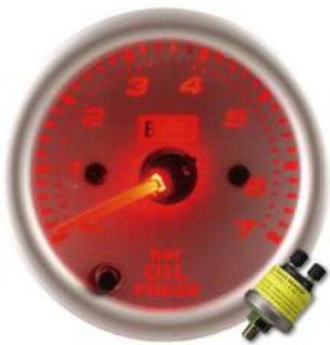
27027SW3-7 ELECTRICAL OIL PRESSURE GAUGE