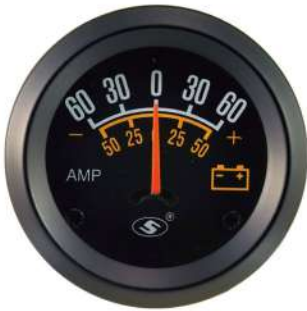
NO.1224AM ELECTRICAL AMMETER GAUGE