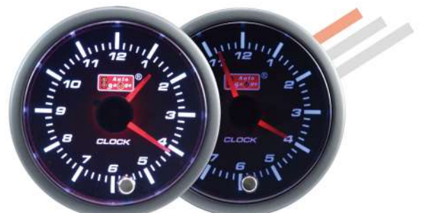
WHITE & BLUE DISPLAY | TWO COLOR & STEPPER MOTOR MOVEMENT |