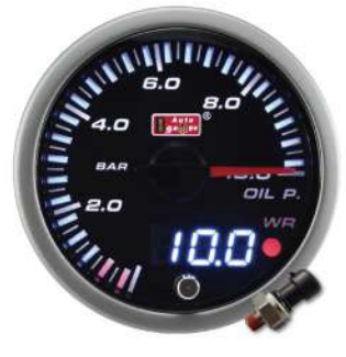
60F25L-OP-R ELECTRICAL OIL PRESSURE GAUGE <0.75BAR