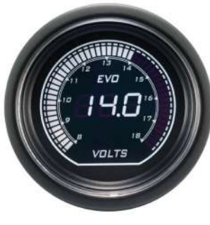
AGEVOWGVO ELECTRICAL VOLT GAUGE