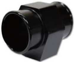
WT3-46 46 mm