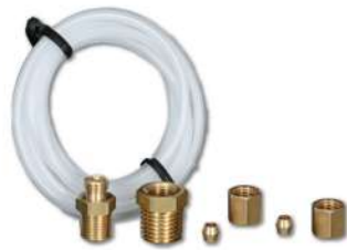
NO.95-6 MECHANICAL OIL PRESSURE GAUGE TUBING KIT(NYLON) 72" 6PCS NUT