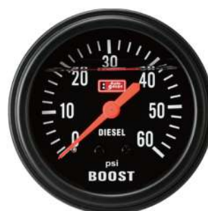
65AGLFBO-60PSI MECHANICAL BOOST GAUGE