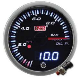
52F25L-OP-R ELECTRICAL OIL PRESSURE GAUGE ! <0.75BAR