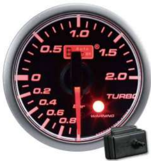
45ABOCL270-SM ELECTRICAL BOOST GAUGE ! >1.5BAR