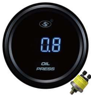
AGTOP-12DG ELECTRICAL OIL PRESSURE GAUGE