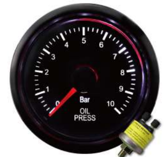
AGAOP270 ELECTRICAL OIL PRESSURE GAUGE