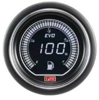
AGEVOWGFL ELECTRICAL FUEL LEVEL GAUGE