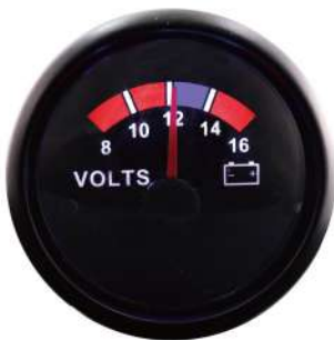
AGAVO ELECTRICAL VOLT GAUGE