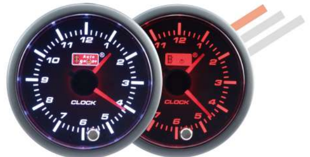
WHITE & AMBER DISPLAY | TWO COLOR & STEPPER MOTOR MOVEMENT |