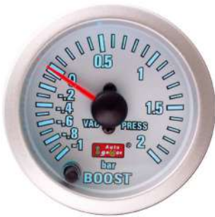
2701SW2-7-BAR MECHANICAL BOOST GAUGE