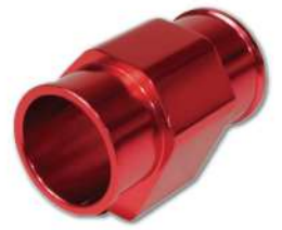
WT3-34 34 mm