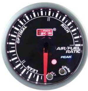
10CAFRSMSWL-PK ELECTRICAL AIR FUEL RATIO GAUGE ! >LEAN ( NARROW BAND )