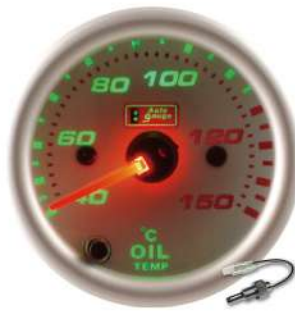
27047SW3-7 ELECTRICAL OIL TEMP GAUGE