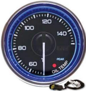
AGOTCL-BLPK-R ELECTRICAL OIL TEMP GAUGE ! >118°C