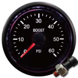
AGABO270-60PSI ELECTRICAL BOOST GAUGE FOR DIESEL 0~60PSI