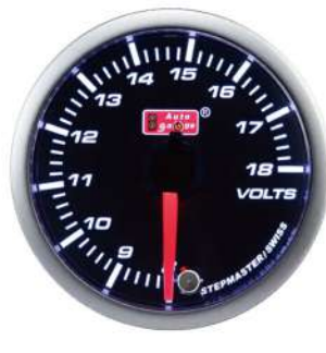
AGVOSMSWL270-WB ELECTRICAL VOLT GAUGE ⚠️ <11.5V