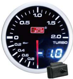
AGBOBLED-60WA ELECTRICAL BOOST GAUGE