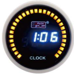
AGCKLCD-BL ELECTRICAL CLOCK GAUGE CENTRAL BLUE LED