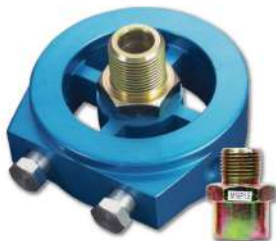
OPOT M18XP1.5 SENSOR ATTACHMENT