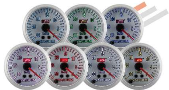
7 COLOR DISPLAY I BLUE & GREEN & NAVY BLUE & PURPLE & RED & WHITE & YELLOW I