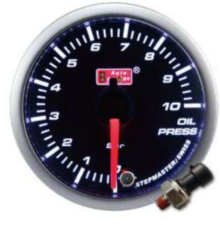
AGOPSMSWL270-WB ELECTRICAL OIL PRESSURE GAUGE ⚠️ <0.75BAR