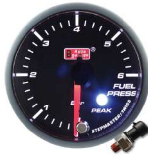
AGFPSMBLSWL270-60PK ELECTRICAL FUEL PRESSURE GAUGE ! <2BAR