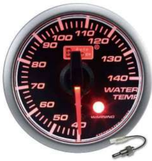
45AWTCL270-SM ELECTRICAL WATER TEMP GAUGE ! >98°C