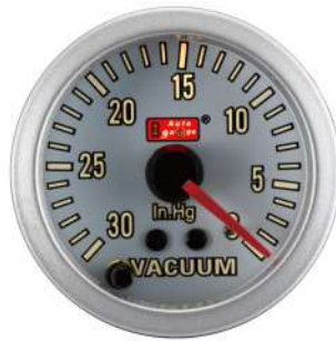
2701SW2-7-PSI MECHANICAL VACUUM GAUGE