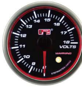
52AGVO-RSM ELECTRICAL VOLT GAUGE ! <11.5V