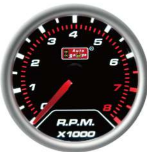
AU-TASWL270-SM ELECTRICAL TACHOMETER STEPPER MOTOR MOVEMENT