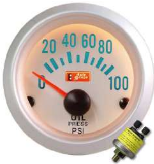
2727SW ELECTRICAL OIL PRESSURE GAUGE