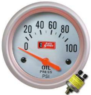
4427SW ELECTRICAL OIL PRESSURE GAUGE