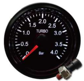
AGABO270-4BAR ELECTRICAL BOOST GAUGE FOR DIESEL 0~4BAR