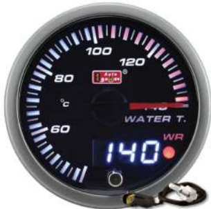
60F25L-WT-R ELECTRICAL WATER TEMP GAUGE >98°C