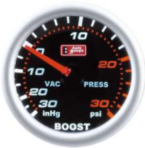
2701SWL-PSI MECHANICAL BOOST GAUGE