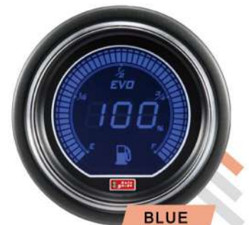
BLUE DISPLAY | DOUBLE VISION |