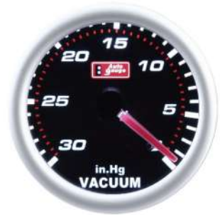
2771SWL MECHANICAL VACUUM GAUGE