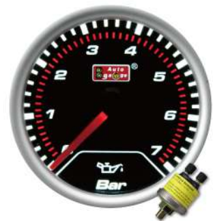
AU-OPSWL270-SM ELECTRICAL OIL PRESSURE GAUGE STEPPER MOTOR MOVEMENT