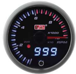
52F25L-TA-R ELECTRICAL TACHOMETER ! >6,500RPM