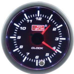
AGCKSMSWL270 ELECTRICAL CLOCK GAUGE 52MM