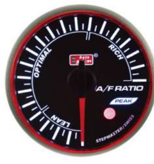
52AGAFR-RPK ELECTRICAL AIR FUEL RATIO GAUGE ! >LEAN (NARROW BAND)