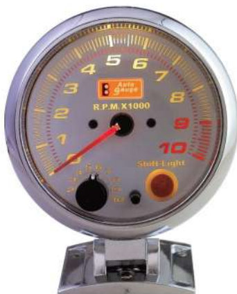
2302SW3-7 ELECTRICAL TACHOMETER 95MM