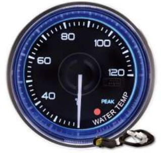
AGWTCL-BLPK-R ELECTRICAL WATER TEMP GAUGE ! >100°C