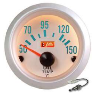
2747SW ELECTRICAL OIL TEMP GAUGE