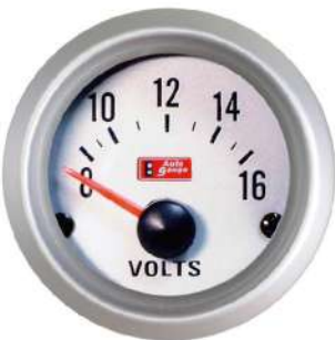
2791SS ELECTRICAL VOLT GAUGE