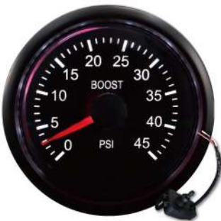
AGABO270-45PSI ELECTRICAL BOOST GAUGE FOR DIESEL 0~45PSI