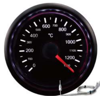
AGAEGT270 ELECTRICAL EXHAUST GAS TEMP GAUGE