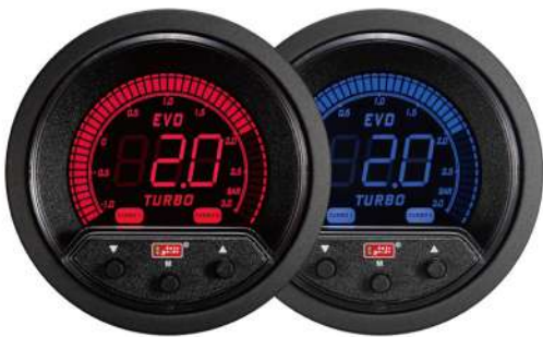
AGEVO-EBC ELECTRICAL BOOST CONTROLLER GAUGE RED & BLUE LCD DISPLAY