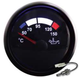
AGAOT ELECTRICAL OIL TEMP GAUGE