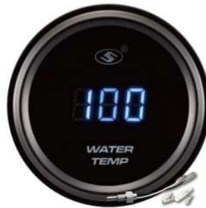
1224WT-DG-C ELECTRICAL WATER TEMP GAUGE 20~150°C