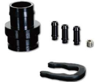
AGADPTBO-3 FOR VAG 2.0 FSI/TSI