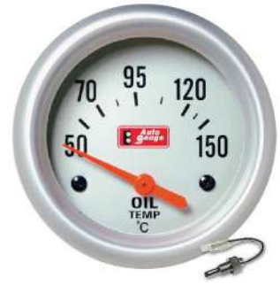
4447SW ELECTRICAL OIL TEMP GAUGE