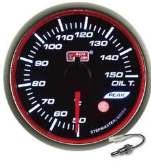
52AGOT-RPK ELECTRICAL OIL TEMP GAUGE ! >118°C