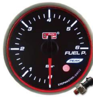
60AGFP-RMT-R ELECTRICAL FUEL PRESSURE GAUGE ! <2BAR