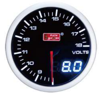
AGVOBLED-60WA ELECTRICAL VOLT GAUGE