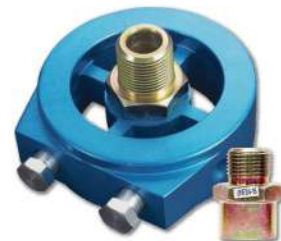
OPOT 3/4UNF-16 SENSOR ATTACHMENT