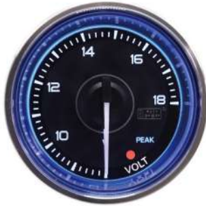
AGVOCL-BLPK-R ELECTRICAL VOLT GAUGE ! <11.5V