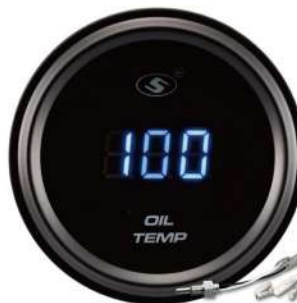
1224OT-DG-F ELECTRICAL OIL TEMP GAUGE 68~302°F