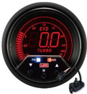
AGEVOBO-60PK-R ELECTRICAL BOOST GAUGE ! >1.5BAR