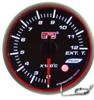
60AGEGT-RPK ELECTRICAL EXHAUST GAS TEMP GAUGE ! >850°C