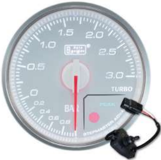
AGBOWHCL-60PK-R ELECTRICAL BOOST GAUGE ! >2.5BAR