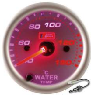
27037SW3-7 ELECTRICAL WATER TEMP GAUGE