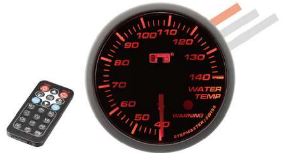
AMBER LED DISPLAY

| OBD-II INTERFACE & REMOTE CONTROLLER |