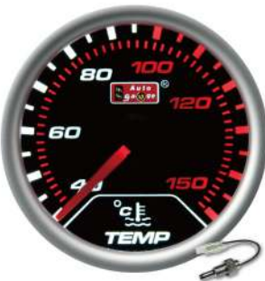
AU-WTSWL270-SM ELECTRICAL WATER TEMP GAUGE STEPPER MOTOR MOVEMENT