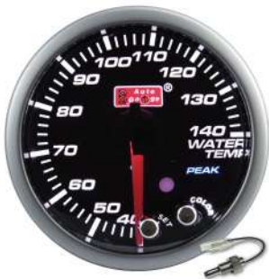
10CWTSMMSWL-PK ELECTRICAL WATER TEMP GAUGE ! <40°C , >98°C