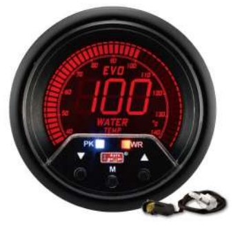
AGEVOWT-60PK-R ELECTRICAL WATER TEMP GAUGE ! >98°C