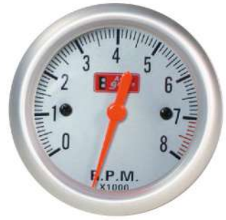
4493SS ELECTRICAL TACHOMETER