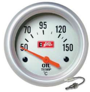
4447SS ELECTRICAL OIL TEMP GAUGE