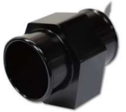
WT3-44 44 mm