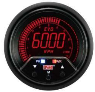
AGEVOTA-60PK-R ELECTRICAL TACHOMETER ! >6,500RPM