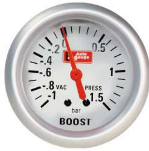
4401SS-BAR MECHANICAL BOOST GAUGE