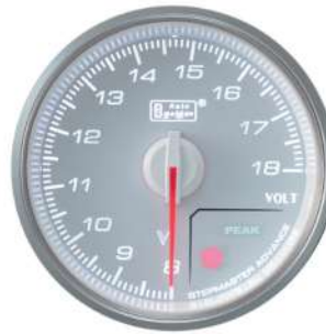
AGVOWHCL-60PK-R ELECTRICAL VOLT GAUGE ! <11.5V