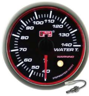
52AGWT-RSM ELECTRICAL WATER TEMP GAUGE ! >100°C