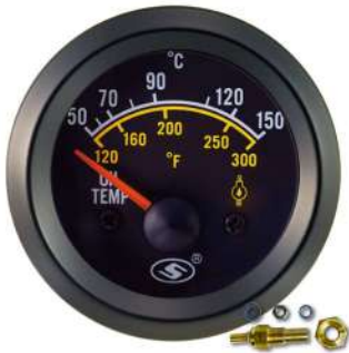
NO.1224OT ELECTRICAL OIL TEMP GAUGE 1/8 NPT SENSOR M16*1.5 ADAPTER