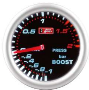
27001SWL-BAR MECHANICAL BOOST GAUGE