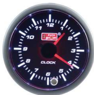
AGCKSMBLSWL270-60 ELECTRICAL CLOCK GAUGE 60MM