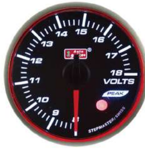
52AGVO-RMT-R ELECTRICAL VOLT GAUGE ! <11.5V