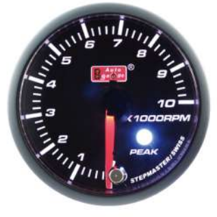
AGTASMBLSWL270-60PK ELECTRICAL TACHOMETER ! >6,500RPM