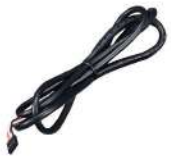
CONTROL UNIT POWER WIRE HARNESS (150cm)