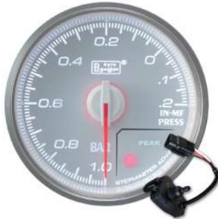
AGVAWHCL-60PK-R ELECTRICAL VACUUM GAUGE ! ≥0BAR