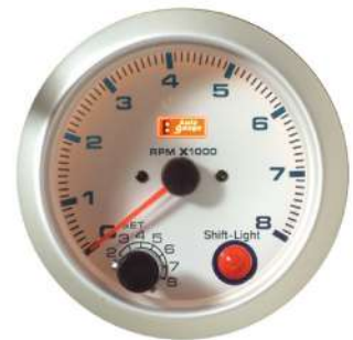
2302SWC-8000 ELECTRICAL TACHOMETER 95MM