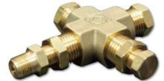
T-4 SENDER ADAPTER FOR OIL TEMP/OIL PRESSURE GAUGE SENDER USE