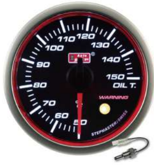
52AGOT-RSM ELECTRICAL OIL TEMP GAUGE ! >118°C