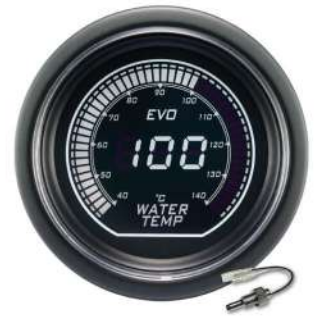
AGEVOWGWT ELECTRICAL WATER TEMP GAUGE