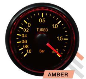
AMBER DISPLAY | DOUBLE VISION |