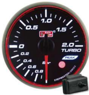
52AGBO-RPK ELECTRICAL BOOST GAUGE ! >1.5BAR