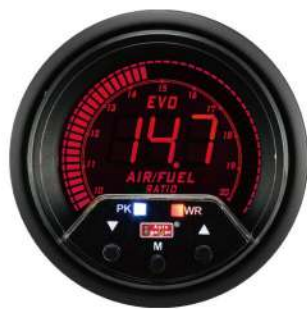
AGEVOAFR-60PK-R ELECTRICAL AIR FUEL RATIO GAUGE ! >18AFR