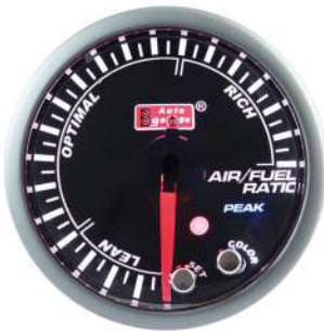
10CAFRSMSWL-60PK ELECTRICAL AIR FUEL RATIO GAUGE ⚠ >LEAN ( NARROW BAND )