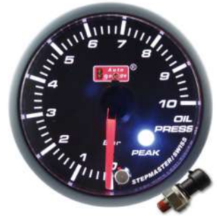
AGOPSMSWL270-60PK ELECTRICAL OIL PRESSURE GAUGE ! <0.75BAR