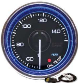
AGOTCL-60BLPK-R ELECTRICAL OIL TEMP GAUGE ! >118°C