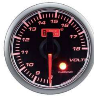
45AVOCL270-SM ELECTRICAL VOLT GAUGE ! <11.5V