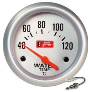
4437SS ELECTRICAL WATER TEMP GAUGE