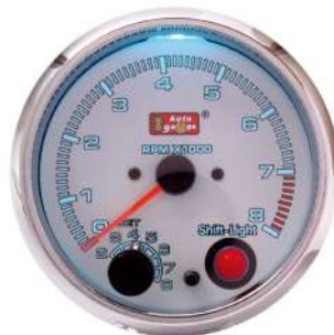
34302SW2-7 ELECTRICAL TACHOMETER 95MM