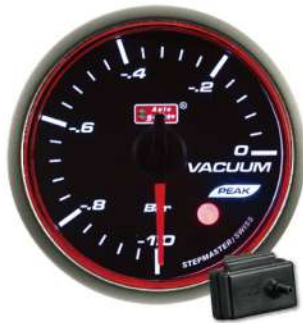
52AGVA-RPK ELECTRICAL VACUUM GAUGE ! ≥0BAR