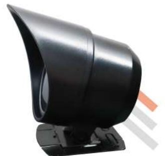
| MOUNTING CAP & GAUGE CAP |