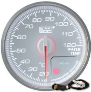
AGWTWHCL-60PK-R ELECTRICAL WATER TEMP GAUGE ! >100°C