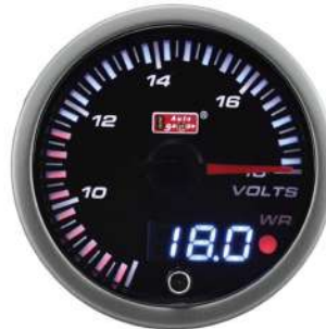
60F25L-VO-R ELECTRICAL VOLT GAUGE <11.5V