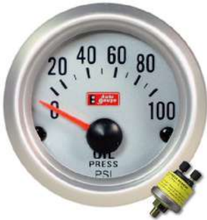
2727SS ELECTRICAL OIL PRESSURE GAUGE