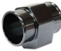
WT3-42 42 mm