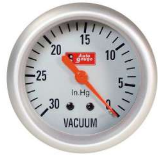
4471SW MECHANICAL VACUUM GAUGE