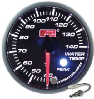
AGWTSMBLSWL270-60PK ELECTRICAL WATER TEMP GAUGE ! >100°C