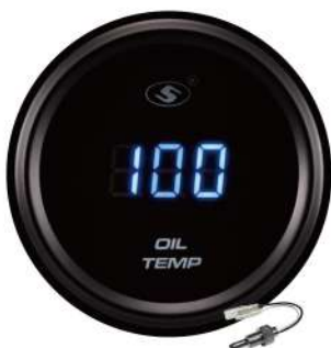
AGTOT-12DG ELECTRICAL OIL TEMP GAUGE