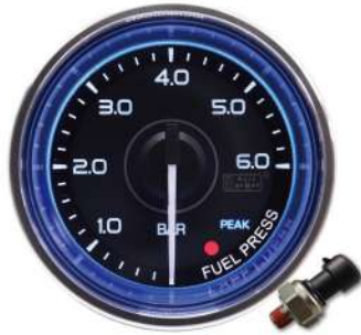
AGFPCL-BLPK-R ELECTRICAL FUEL PRESSURE GAUGE ! <2BAR