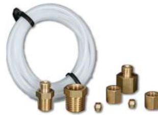
NO.95-7 MECHANICAL OIL PRESSURE GAUGE TUBING KIT(NYLON) 72" 7PCS NUT