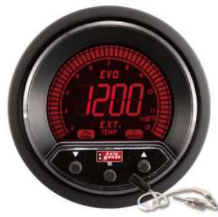
AGEVOEGT-PK-R ELECTRICAL EXHAUST GAS TEMP GAUGE ! >850°C