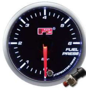
AGFPSMSWL270-WB ELECTRICAL FUEL PRESSURE GAUGE ⚠️ <2BAR