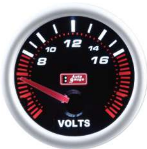
2791SWL ELECTRICAL VOLT GAUGE AIR CORE MOVEMENT