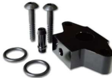
AGADPTBO-5 FOR BMW N20 ENGINE