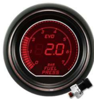
AGEVOEFP ELECTRICAL FUEL PRESSURE GAUGE