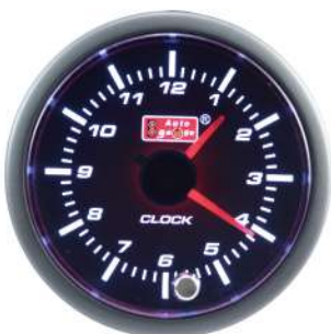
AGCKSMBLSWL270 ELECTRICAL CLOCK GAUGE 52MM