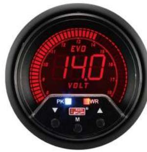
AGEVOVO-60PK-R ELECTRICAL VOLT GAUGE ! <11.5V