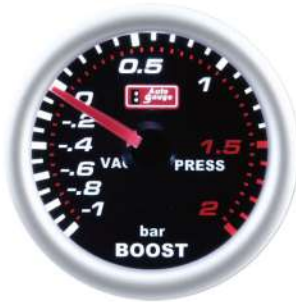
2701SWL-BAR MECHANICAL BOOST GAUGE