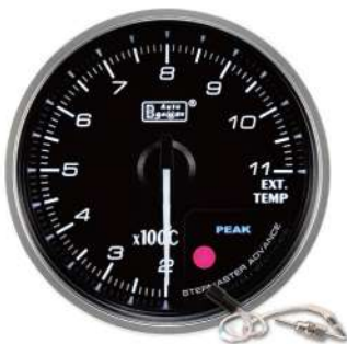
AGEGTCL-PK-R ELECTRICAL EXHAUST GAS TEMP GAUGE ! >850°C