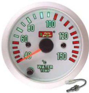
2737SW2-7 ELECTRICAL WATER TEMP GAUGE