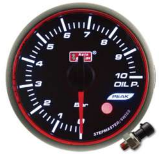
52AGOP-RPK ELECTRICAL OIL PRESSURE GAUGE ! <0.75BAR