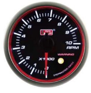
52AGTA-RSM ELECTRICAL TACHOMETER ! >6,500RPM