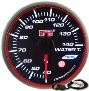
52AGWT-RMT-R ELECTRICAL WATER TEMP GAUGE ! >100°C