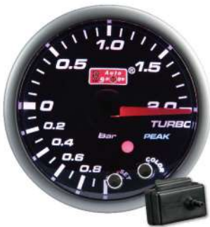
10CBOSMSWL-PK ELECTRICAL BOOST GAUGE ! <-1BAR , >1.5BAR