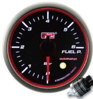
52AGFP-RSM ELECTRICAL FUEL PRESSURE GAUGE ! <2BAR