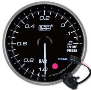
AGVACL-PK-R ELECTRICAL VACUUM GAUGE ! ≥0BAR