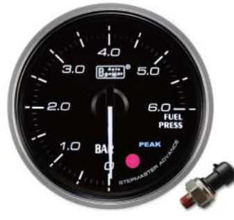
AGFPCL-PK-R ELECTRICAL FUEL PRESSURE GAUGE ! <2BAR