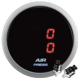
AGDAPLCD-R ELECTRICAL AIR PRESS GAUGE 0~15.2BAR / 0~220PSI