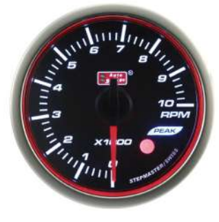
60AGTA-RPK ELECTRICAL TACHOMETER ! >6,500RPM