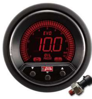
AGEVOOP-PK-R ELECTRICAL OIL PRESSURE GAUGE ! <0.75BAR