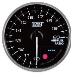
AGAFRCL-PK-R ELECTRICAL AIR FUEL RATIO GAUGE ! >18AFR ( NARROW BAND )