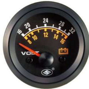
NO.1224VO ELECTRICAL VOLT GAUGE