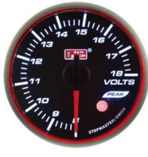
52AGVO-RPK ELECTRICAL VOLT GAUGE ! <11.5V