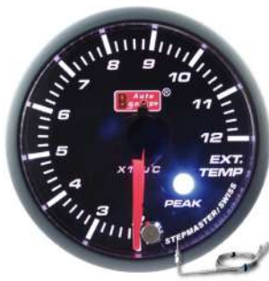
AGEGTSMSWL270-60PK ELECTRICAL EXHAUST GAS TEMP GAUGE ! >850°C