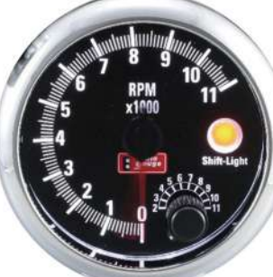
2302SWL-SM ELECTRICAL TACHOMETER STEPPER MOTOR MOVEMENT 95MM