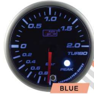
BLUE DISPLAY | DOUBLE VISION | | MOUNTING CAP & GAUGE CAP |