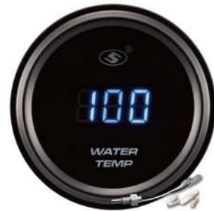
1224WT-DG-F ELECTRICAL WATER TEMP GAUGE 68~302°F