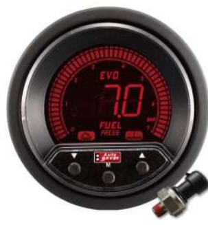
AGEVOFP-PK-R ELECTRICAL FUEL PRESSURE GAUGE ! <2BAR