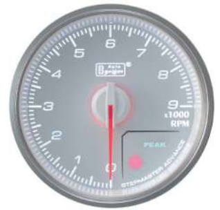
AGTAWHCL-60PK-R ELECTRICAL TACHOMETER ! >6,500RPM