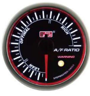
60AGAFR-RSM ELECTRICAL AIR FUEL RATIO GAUGE ! >LEAN ( NARROW BAND )