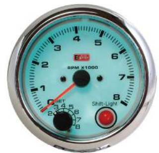
2302SEL-2 ELECTRICAL TACHOMETER