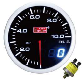
AGOPBLED-60WA ELECTRICAL OIL PRESSURE GAUGE