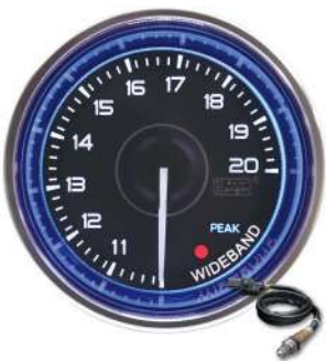
AGAFRCL-60BLPKWB4.9-WO-R ELECTRICAL WIDEBAND AIR FUEL RATIO GAUGE ! >18AFR