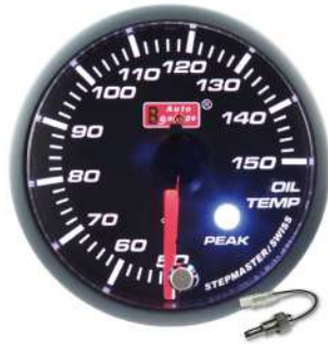
AGOTSMBLSWL270-60PK ELECTRICAL OIL TEMP GAUGE ! >118°C