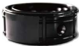
AGADPTOP-1 FOR VAG 1.4TSI