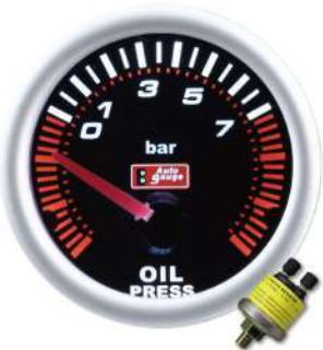
2727SWL ELECTRICAL OIL PRESSURE GAUGE AIR CORE MOVEMENT