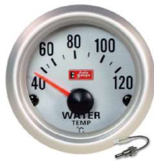
2737SS ELECTRICAL WATER TEMP GAUGE