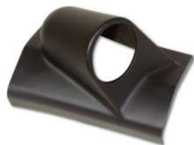
AL-01B (BLACK) AL-01CA (CARBON LOOK)