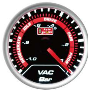
AU-VASWL270 MECHANICAL VACUUM GAUGE