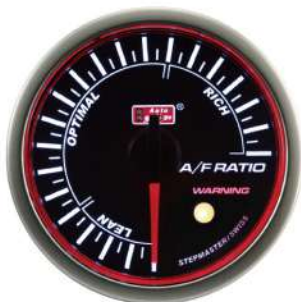
52AGAFR-RSM ELECTRICAL AIR FUEL RATIO GAUGE ! >LEAN ( NARROW BAND )