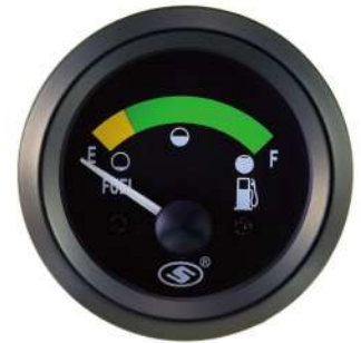
NO.1224FL ELECTRICAL FUEL LEVEL GAUGE 240~33Q