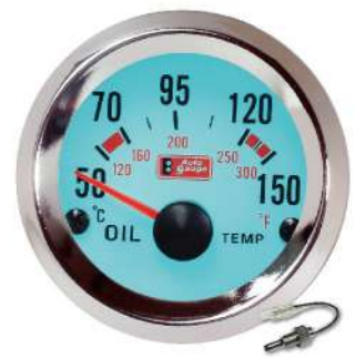
2747SEL-2 ELECTRICAL OIL TEMP GAUGE