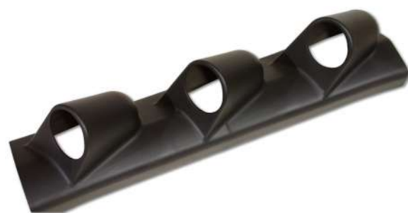
AL-03B (BLACK) AL-03CA (CARBON LOOK)