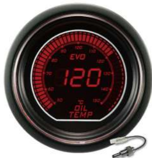
AGEVOOT ELECTRICAL OIL TEMP GAUGE