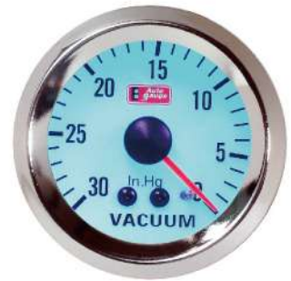
2771SEL-2 MECHANICAL VACUUM GAUGE