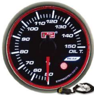
52AGOT-RMT-R ELECTRICAL OIL TEMP GAUGE ! >118°C