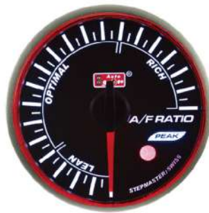
60AGAFR-RMT-R ELECTRICAL AIR FUEL RATIO GAUGE ! >LEAN (NARROW BAND)