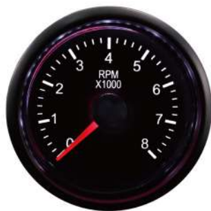
AGATA270-0-80 ELECTRICAL TACHOMETER