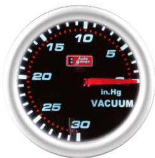
27071SWL MECHANICAL VACUUM GAUGE