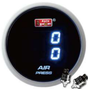
AGDPLCD-BL ELECTRICAL DUAL PRESS GAUGE