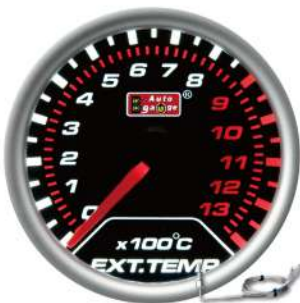
AU-EGTSWL270-SM ELECTRICAL EXHAUST GAS TEMP GAUGE STEPPER MOTOR MOVEMENT