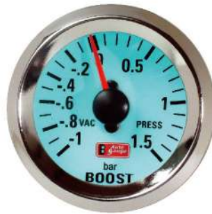
2701SEL-2-BAR MECHANICAL BOOST GAUGE