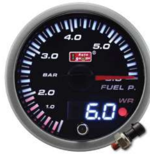
60F25L-FP-R ELECTRICAL FUEL PRESSURE GAUGE <2BAR