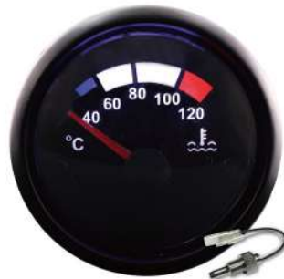
AGAWT ELECTRICAL WATER TEMP GAUGE