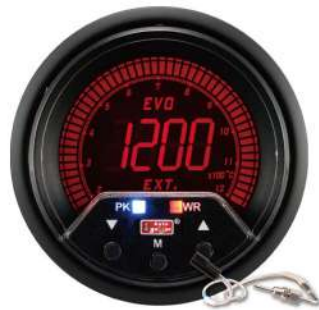
AGEVOEGT-R ELECTRICAL EXHAUST GAS TEMP GAUGE ! >850°C