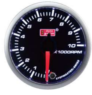
AGTASMSWL270-WB ELECTRICAL TACHOMETER ⚠️ >6,500RPM