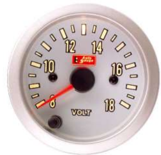
2791SW2-7 ELECTRICAL VOLT GAUGE