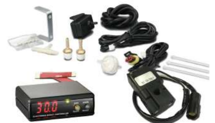
AGEBC-2 ELECTRICAL BOOST CONTROLLER