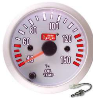
2747SW2-7 ELECTRICAL OIL TEMP GAUGE