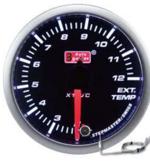
AGEGTSMSWL270-WB ELECTRICAL EXHAUST GAS TEMP GAUGE ⚠️ >850°C