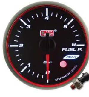
52AGFP-RMT-R ELECTRICAL FUEL PRESSURE GAUGE ! <2BAR