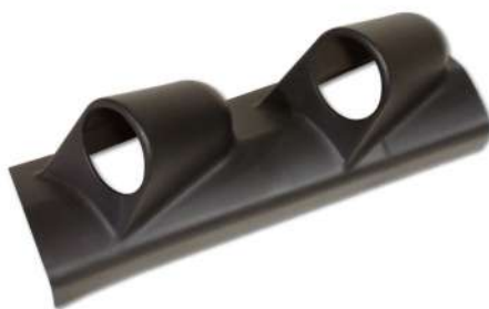
AL-02B (BLACK) AL-02CA (CARBON LOOK)