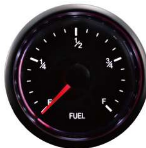
AGAFL270-24033 ELECTRICAL FUEL LEVEL GAUGE 240~33Ω