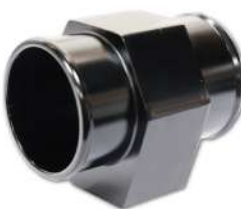
WT3-50 50 mm