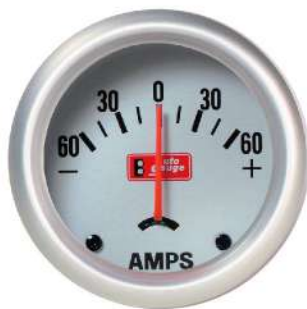
4492SS ELECTRICAL AMMETER GAUGE