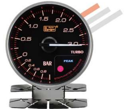
AMBER DISPLAY | DOUBLE VISION |