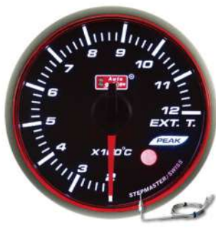
52AGEGT-RPK ELECTRICAL EXHAUST GAS TEMP GAUGE ! >850°C