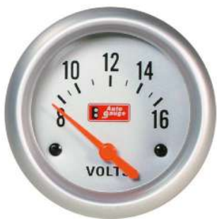
4791SS ELECTRICAL VOLT GAUGE