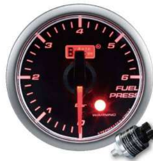
45AFPCl270-SM ELECTRICAL FUEL PRESSURE GAUGE ! <2BAR