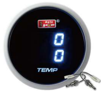
AGDTLCD-BL ELECTRICAL DUAL TEMP GAUGE