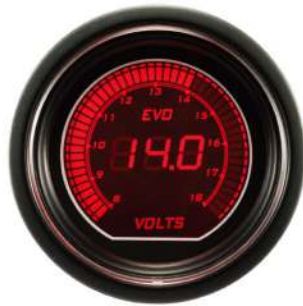
AGEVOVO ELECTRICAL VOLT GAUGE