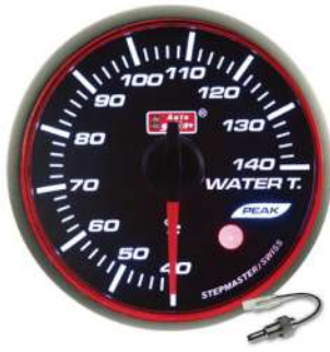
52AGWT-RPK ELECTRICAL WATER TEMP GAUGE ! >100°C