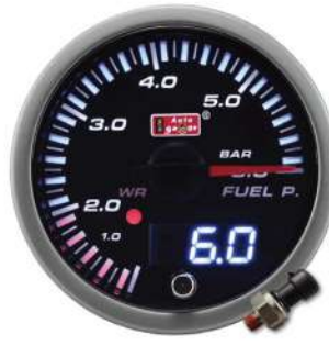
52F25L-FP-R ELECTRICAL FUEL PRESSURE GAUGE ! <2BAR