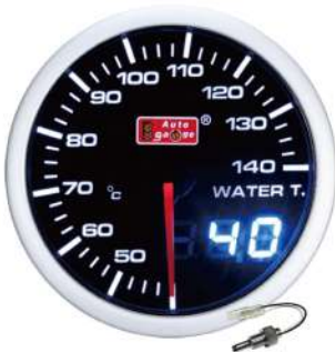
AGWTBLED-60WA ELECTRICAL WATER TEMP GAUGE