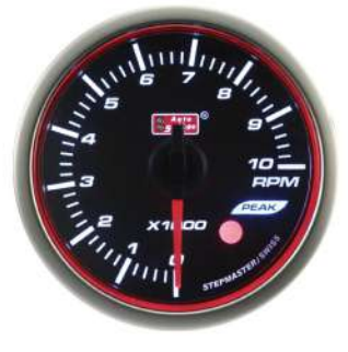
52AGTA-RPK ELECTRICAL TACHOMETER ! >6,500RPM