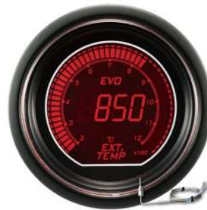
AGEVOEGT ELECTRICAL EXHAUST GAS TEMP GAUGE