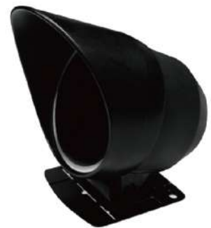
| MOUNTING & GAUGE CUP |