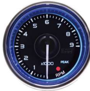
AGTACL-BLPK-R ELECTRICAL TACHOMETER ! >6,500RPM