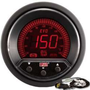
AGEVOOT-PK-R ELECTRICAL OIL TEMP GAUGE ! >118°C