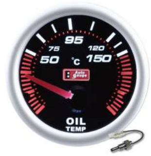
2747SWL ELECTRICAL OIL TEMP GAUGE AIR CORE MOVEMENT