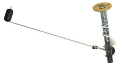
NO.94 ELECTRICAL FUEL TANK FLOAT