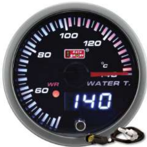
52F25L-WT-R ELECTRICAL WATER TEMP GAUGE ! >98°C