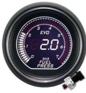
AGEVOWGEFP ELECTRICAL FUEL PRESSURE GAUGE