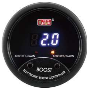
AGEBC-R ELECTRICAL BOOST CONTROLLER GAUGE