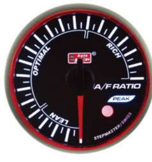
60AGAFR-RPK ELECTRICAL AIR FUEL RATIO GAUGE ! >LEAN (NARROW BAND)