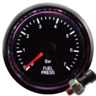
AGAEFP270 ELECTRICAL FUEL PRESSURE GAUGE