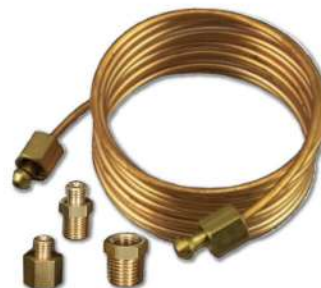
NO.96-7-120" MECHANICAL OIL PRESSURE GAUGE TUBING KIT( BARSS ) 120" 7PCS NUT