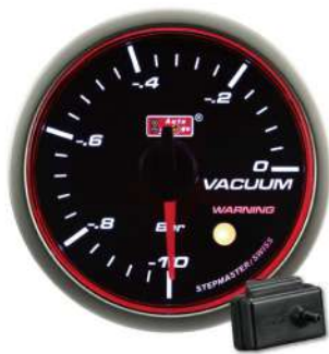
52AGVA-RSM ELECTRICAL VACUUM GAUGE ! ≥0BAR