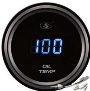
1224OT-DG-C ELECTRICAL OIL TEMP GAUGE 20~150°C