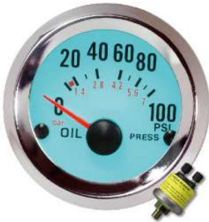
2727SEL-2 ELECTRICAL OIL PRESSURE GAUGE