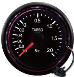
AGABO270 ELECTRICAL BOOST GAUGE -1~2BAR