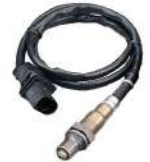
BOSCH LSU4.9 O2 SENSOR