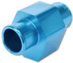
WT3-26 26 mm