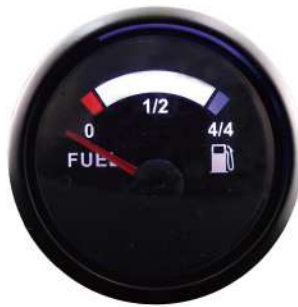
AGAFL ELECTRICAL FUEL LEVEL GAUGE 10~180Ω / 240~33Ω