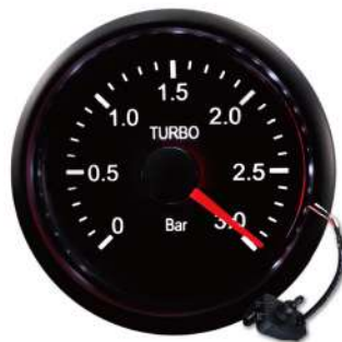
AGABO270-3BAR ELECTRICAL BOOST GAUGE FOR DIESEL 0~3BAR