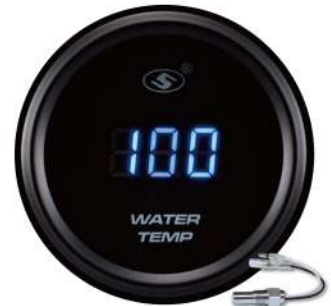
AGTWT-12DG ELECTRICAL WATER TEMP GAUGE