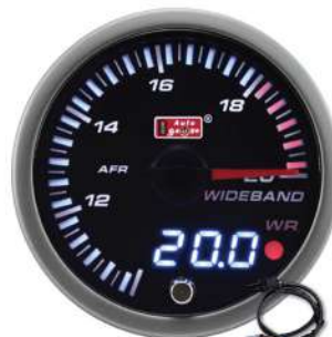
60F25L-AFRPKWB4.9-WO ELECTRICAL WIDEBAND AIR FUEL RATIO GAUGE >18AFR