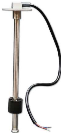
FUEL / WATER LEVEL FLOAT 304 Stainless