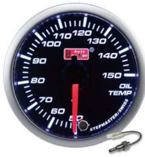
AGOTSMSWL270-WB ELECTRICAL OIL TEMP GAUGE ⚠️ >118°C