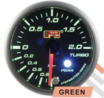
GREEN DISPLAY | DOUBLE VISION | | MOUNTING CAP & GAUGE CAP |