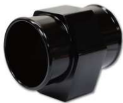
WT3-48 48 mm