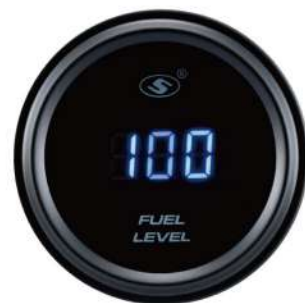
1224FL-DG ELECTRICAL FUEL LEVEL GAUGE 240~33Ω