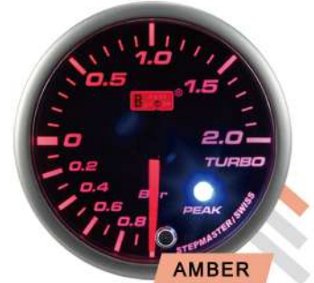
AMBER DISPLAY | DOUBLE VISION | | MOUNTING CAP & GAUGE CAP |