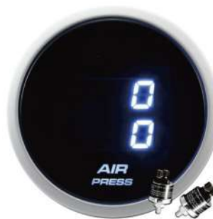
AGDAPLCD-BL ELECTRICAL AIR PRESS GAUGE 0~15.2BAR / 0~220PSI