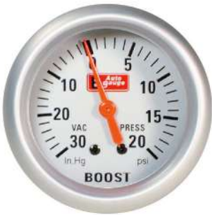
4401SW-PSI MECHANICAL BOOST GAUGE