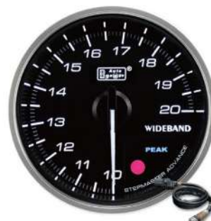
AGAFRCL-60PKWB4.9-WO ELECTRICAL WIDEBAND AIR FUEL RATIO GAUGE ! >18AFR