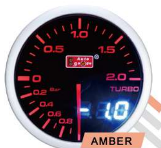
AMBER DISPLAY | DOUBLE VISION |