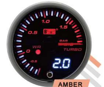
AMBER DISPLAY | DOUBLE VISION | | MOUNTING CAP & GAUGE CAP |