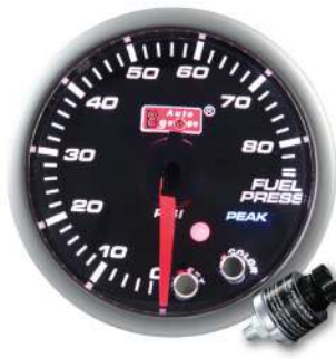
10CFPSMSWL-PK ELECTRICAL FUEL PRESSURE GAUGE ! <29PSI , >85PSI