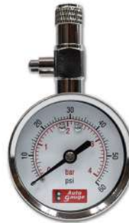
TG-050 2" TIRE GAUGE