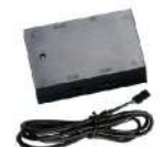
CONTROL UNIT WITH OUTPUT FUNCTION