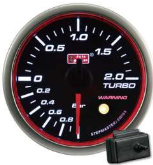
52AGBO-RSM ELECTRICAL BOOST GAUGE ! >1.5BAR