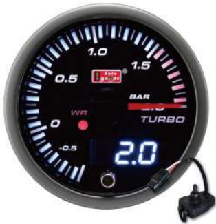
52F25L-BO-R ELECTRICAL BOOST GAUGE ! >1.5BAR