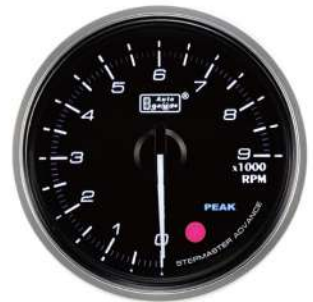
AGTACL-PK-R ELECTRICAL TACHOMETER ! >6,500RPM