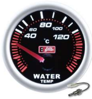
2737SWL ELECTRICAL WATER TEMP GAUGE AIR CORE MOVEMENT