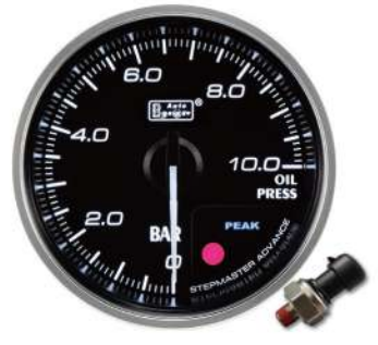
AGOPCL-PK-R ELECTRICAL OIL PRESSURE GAUGE ! <0.75BAR