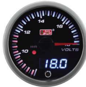
52F25L-VO-R ELECTRICAL VOLT GAUGE ! <11.5V