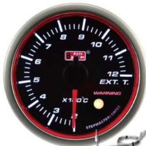
52AGEGT-RSM ELECTRICAL EXHAUST GAS TEMP GAUGE ! >850°C