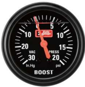
65AGLFBO MECHANICAL BOOST GAUGE