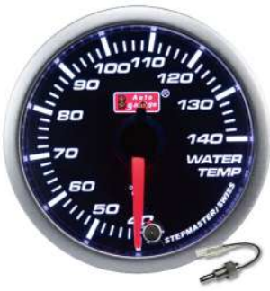
AGWTSMSWL270-WB ELECTRICAL WATER TEMP GAUGE ⚠️ >100°C