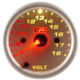
27091SW3-7 ELECTRICAL VOLT GAUGE