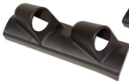
AL-02B (BLACK) AL-02CA (CARBON LOOK)