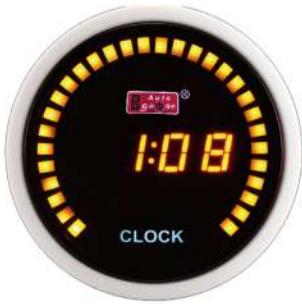
AGCKLCD-AM ELECTRICAL CLOCK GAUGE CENTRAL AMBER LED