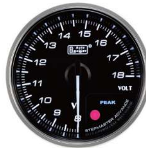
AGVOCL-PK-R ELECTRICAL VOLT GAUGE ! <11.5V