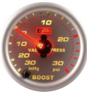
27001SW3-7-PSI MECHANICAL BOOST GAUGE