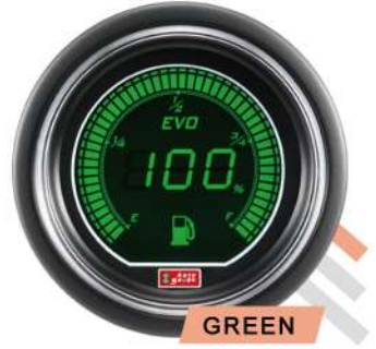
GREEN DISPLAY | DOUBLE VISION |