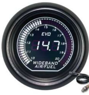
AGEVOWGAFR-WB4.9-WO ELECTRICAL WIDEBAND AIR FUEL RATIO GAUGE