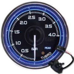
AGBOCL-BLPK-R ELECTRICAL BOOST GAUGE ! >3BAR