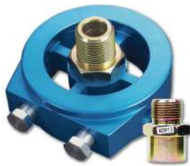
OPOT M20XP1.5 SENSOR ATTACHMENT