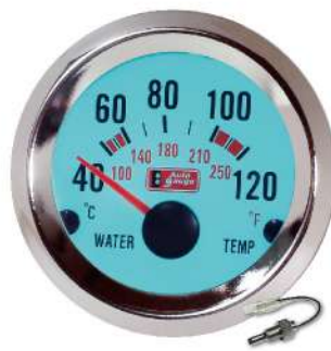
2737SEL-2 ELECTRICAL WATER TEMP GAUGE