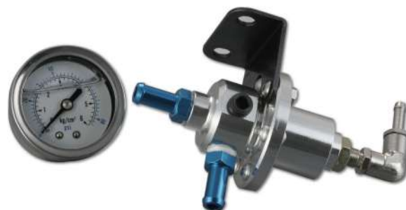
AGFRP FUEL PRESS REGULAR (W/GAUGE)