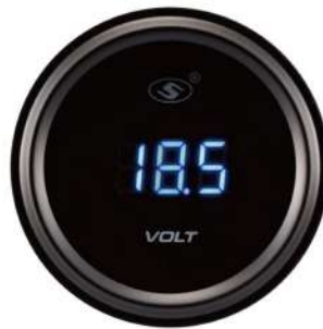
1224VO-DG-24 ELECTRICAL VOLT GAUGE 16~32V