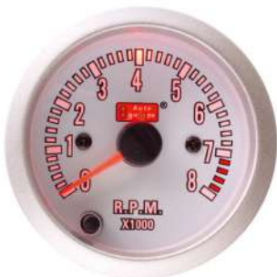
2302SW2-7 ELECTRICAL TACHOMETER