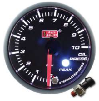
AGOPSMGRSWL270-60PK ELECTRICAL OIL PRESSURE GAUGE ! <0.75BAR