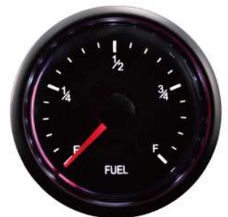
AGAFL270-10180 ELECTRICAL FUEL LEVEL GAUGE 10~180Ω