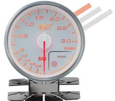
AMBER DISPLAY | DOUBLE VISION |