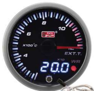
60F25L-EGT-R ELECTRICAL EXHAUST GAS TEMP GAUGE >850°C