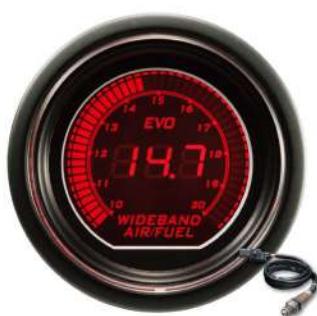
AGEVOAFR-WB4.9-WO ELECTRICAL WIDE BAND AIR FUEL RATIO GAUGE