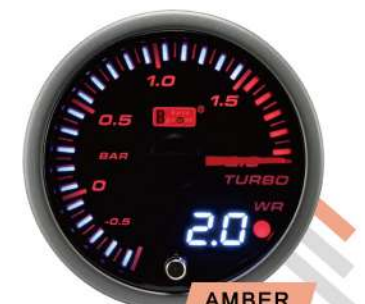
AMBER DISPLAY | DOUBLE VISION | | MOUNTING CAP & GAUGE CAP |