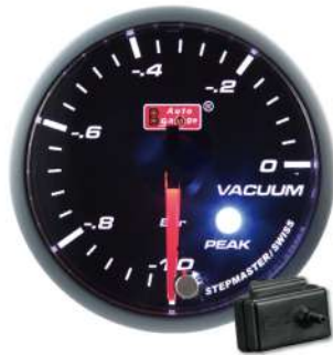
AGVASMBLSWL270-60PK ELECTRICAL VACUUM GAUGE ! ≥0BAR