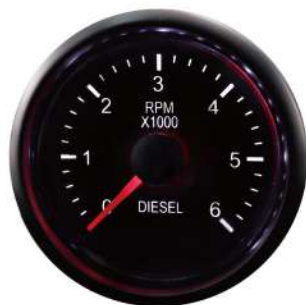
AGATA270-0-60 ELECTRICAL TACHOMETER FOR DIESEL