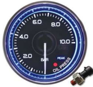
AGOPCL-BLPK-R ELECTRICAL OIL PRESSURE GAUGE ! <0.75BAR