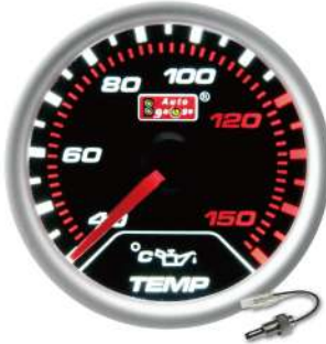
AU-OTSWL270-SM ELECTRICAL OIL TEMP GAUGE STEPPER MOTOR MOVEMENT