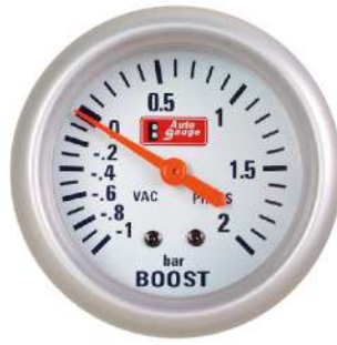
4401SW-BAR MECHANICAL BOOST GAUGE