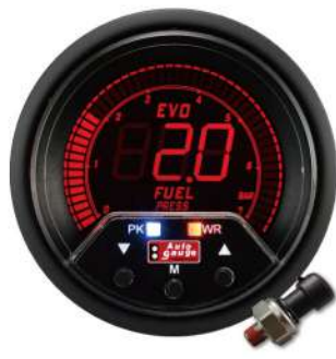
AGEVOFP-60PK-R ELECTRICAL FUEL PRESSURE GAUGE ! <2BAR