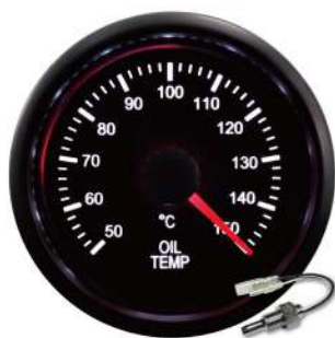
AGAOT270 ELECTRICAL OIL TEMP GAUGE