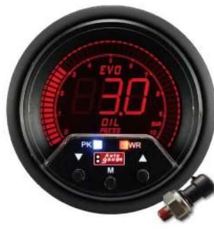
AGEVOOP-60PK-R ELECTRICAL OIL PRESSURE GAUGE ! <0.75BAR