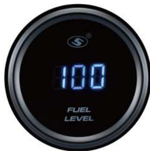
AGTFL-12DG ELECTRICAL FUEL LEVEL GAUGE 240~33Ω / 0~190Ω / 10~180Ω