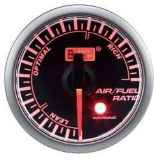
45AAFRC1270-SM ELECTRICAL AIR FUEL RATIO GAUGE ! >LEAN ( NARROW BAND )