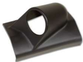
AL-01B (BLACK) AL-01CA (CARBON LOOK)