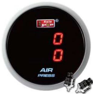
AGDPLCD-R ELECTRICAL DUAL PRESS GAUGE