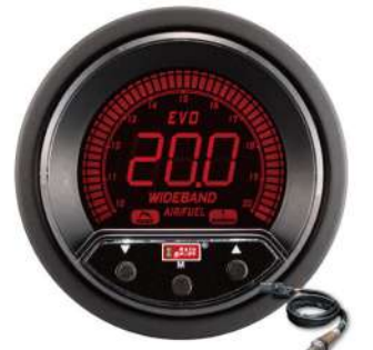
AGEVOAFR-PKWB4.9-WO ELECTRICAL WIDEBAND AIR FUEL RATIO GAUGE ! >18AFR