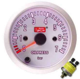
2727SW2-7 ELECTRICAL OIL PRESSURE GAUGE