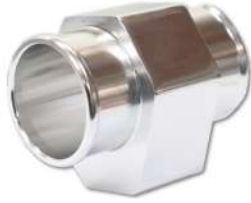
WT3-38 38 mm