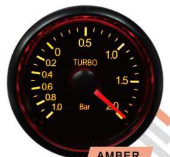
AMBER DISPLAY | DOUBLE VISION |