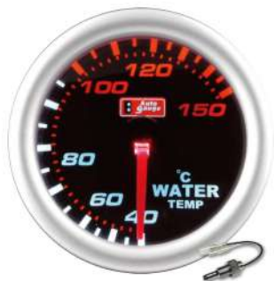
27037SWL-SM ELECTRICAL WATER TEMP GAUGE STEPPER MOTOR MOVEMENT