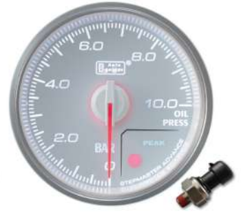
AGOPWHCL-60PK-R ELECTRICAL OIL PRESSURE GAUGE ! <0.75BAR