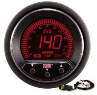
AGEVOWT-PK-R ELECTRICAL WATER TEMP GAUGE ! >98°C