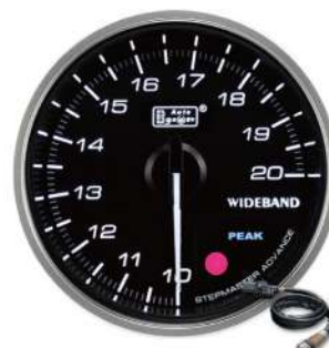
AGAFRCL-PKWB4.9-WO ELECTRICAL WIDEBAND AIR FUEL RATIO GAUGE ! >18AFR