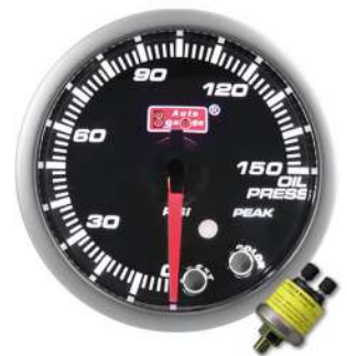
10COPSMSWL-PK ELECTRICAL OIL PRESSURE GAUGE ! <10PSI , >150PSI