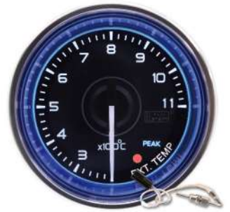
AGEGTCL-BLPK-R ELECTRICAL EXHAUST GAS TEMP GAUGE ! >850°C