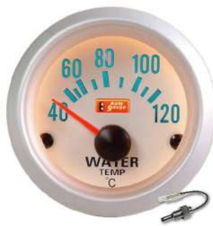
2737SW ELECTRICAL WATER TEMP GAUGE