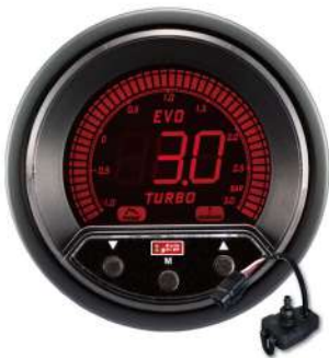
AGEVOBO-PK-R ELECTRICAL BOOST GAUGE ! >1.5BAR