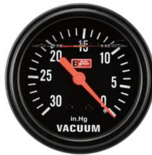
65AGLFVA MECHANICAL VACUUM GAUGE