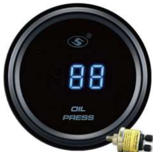
1224OP-DG-PSI ELECTRICAL OIL PRESSURE GAUGE 0~150PSI