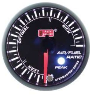
AGAFRSMBLSWL270-60PK ELECTRICAL AIR FUEL RATIO GAUGE ! >LEAN ( NARROW BAND )