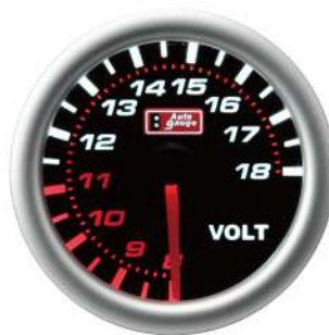
27091SWL-SM ELECTRICAL VOLT GAUGE STEPPER MOTOR MOVEMENT