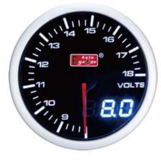
AGVOBLED-WA ELECTRICAL VOLT GAUGE