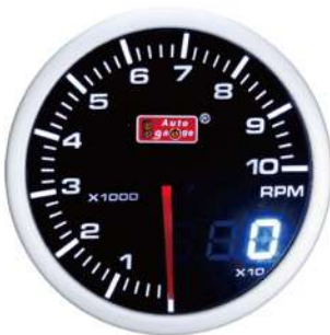
AGATABLED-60WA ELECTRICAL TACHOMETER GAUGE