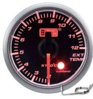
45AEGTCL270-SM ELECTRICAL EXHAUST GAS TEMP GAUGE ! >850°C