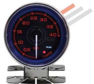
AMBER DISPLAY | BLUE ANGEL RIM |