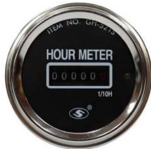
NO.GH521C ELECTRICAL HOUR METER GAUGE 6~50V ( CHROME RIM )