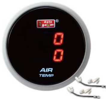
AGDATLCD-R ELECTRICAL DUAL AIR TEMP GAUGE