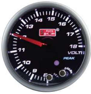
10CVOSMSWL-PK ELECTRICAL VOLT GAUGE ! <11.5V , >16V