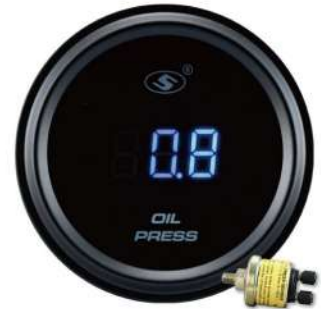
1224OP-DG-BAR ELECTRICAL OIL PRESSURE GAUGE 0~10BAR