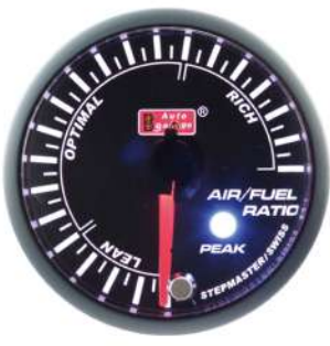
AGAFRSMSWL270-60PK ELECTRICAL AIR FUEL RATIO GAUGE ! >LEAN ( NARROW BAND )