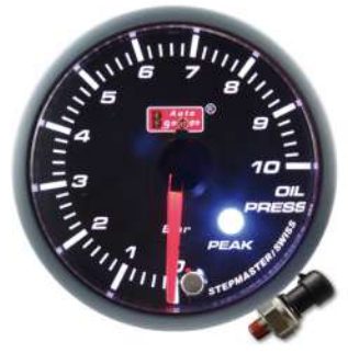
AGOPSMBLSWL270-60PK ELECTRICAL OIL PRESSURE GAUGE ! <0.75BAR