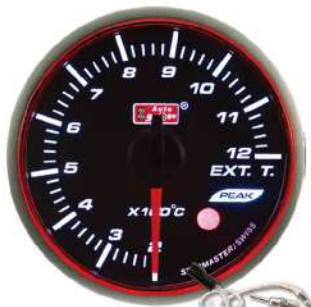
52AGEGT-RMT-R ELECTRICAL EXHAUST GAS TEMP GAUGE ! >850°C