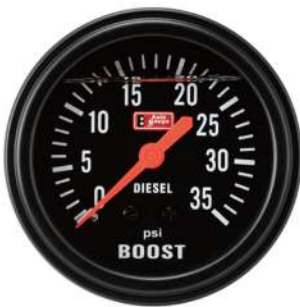
65AGLFBO-35PSI MECHANICAL BOOST GAUGE