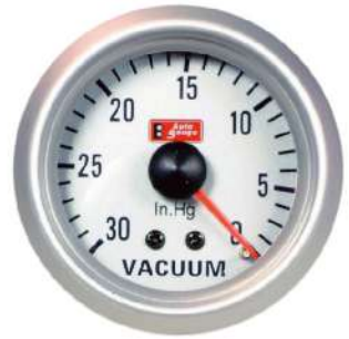
2771SS MECHANICAL VACUUM GAUGE