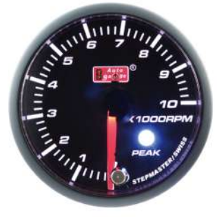
AGTASMSWL270-60PK ELECTRICAL TACHOMETER ! >6,500RPM