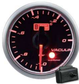
45AVACL270-SM ELECTRICAL VACUUM GAUGE ! ≥0BAR