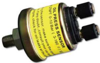
27-SENDER OIL PRESSURE GAUGE SENSOR